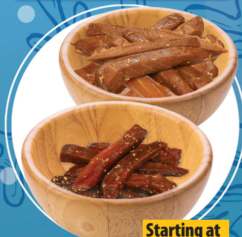
Smoked Ahi or Marlin Strips Selected Varieties