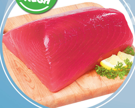
Ahi Chunks or Steaks (#2 Medium Grade)